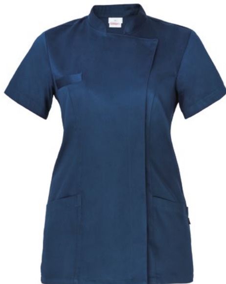
Art. 14P03K494 004 Blu / Blue