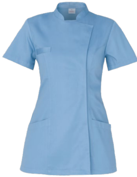
Art. 17P03K494 118 Azzurro / Light blue