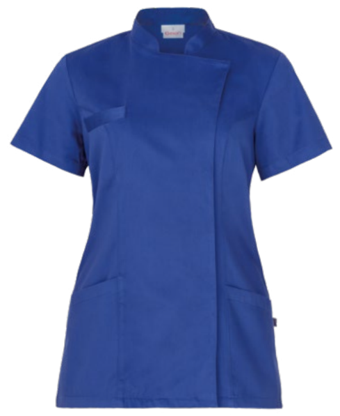
Art. 17P03K494 321 Bluette / Royal