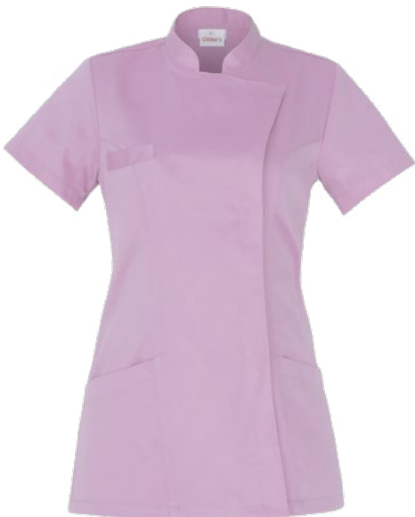
Art. 17P03K494 597 Lilla / Lilac