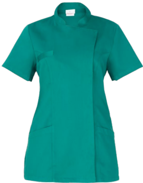
Art. 17P03K494 002 Verde / Green