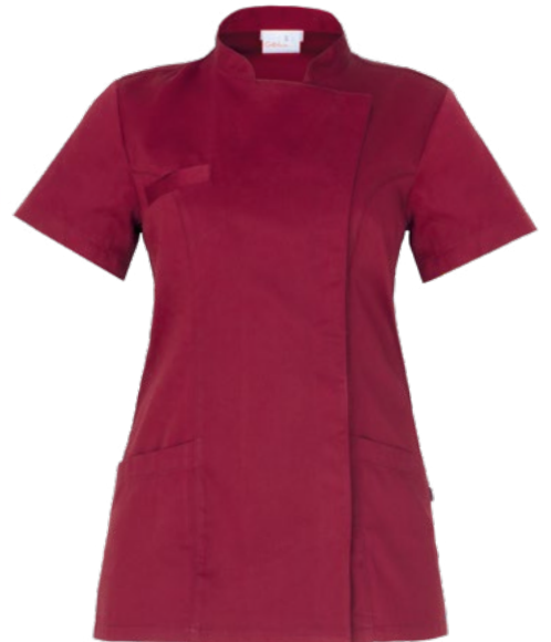
Art. 12P03K269 519 Bordeaux / Burgundy